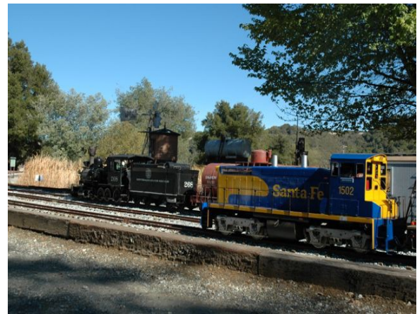
Portola Valley & Alpine Motive Power