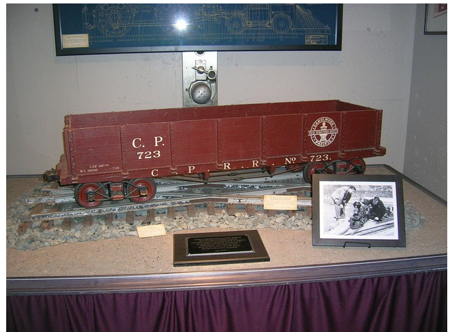
The gondola and crossing track are from Disney's private live steam track that formally circled his home in the Los Angeles hills in the 1950's.