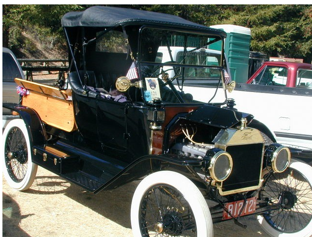
1914 Model T Ford pick-up,