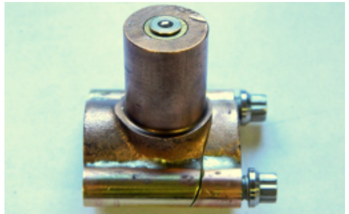
Charlie Reiter – Adjustable lathe cross-slide nut designed to be adjustable to take up the thread backlash..