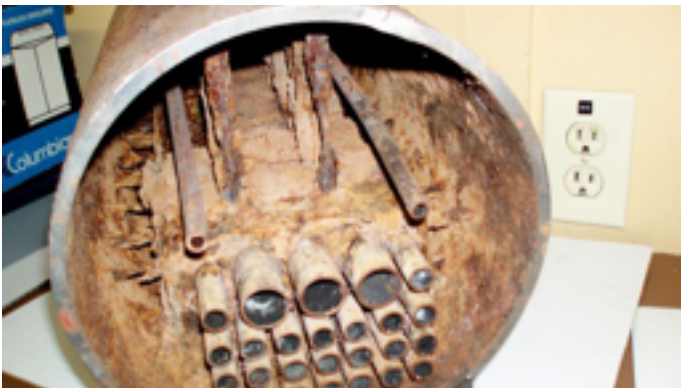
Rich Croll – The reality of the inside of a failed boiler. This is a real "eye-opener"...what members rarely see in their own locos. Photo P3120122 & 123