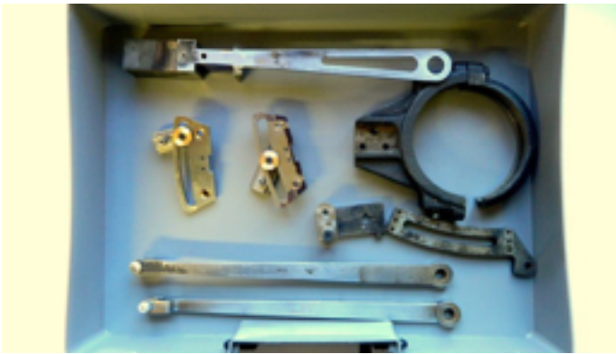
A box of various fabricated locomotive parts.