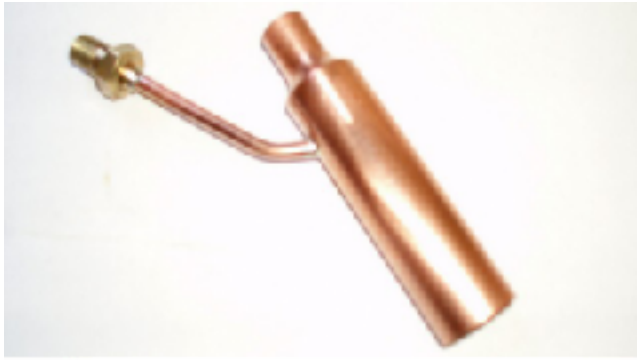
Stack Ejector for same small engine.