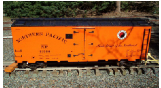
Walt Oellerich – PSC Reefer Car.