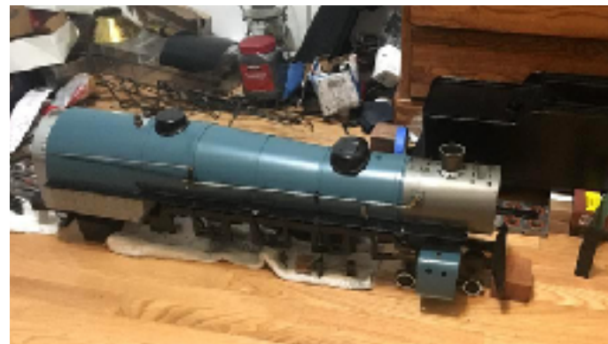
Photo of partial completion of the engine.