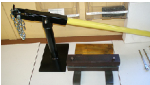
Rerailer for large locomotives...an improved design.