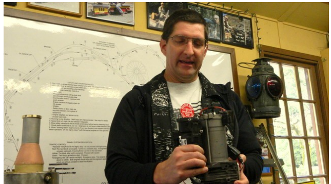
A Land Rover air compressor with unidentified internal thread.