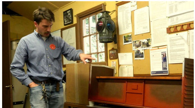
From James Bradas – A riding Car with box car sides; under construction.