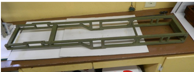
and frame for the CP Huntington loco.