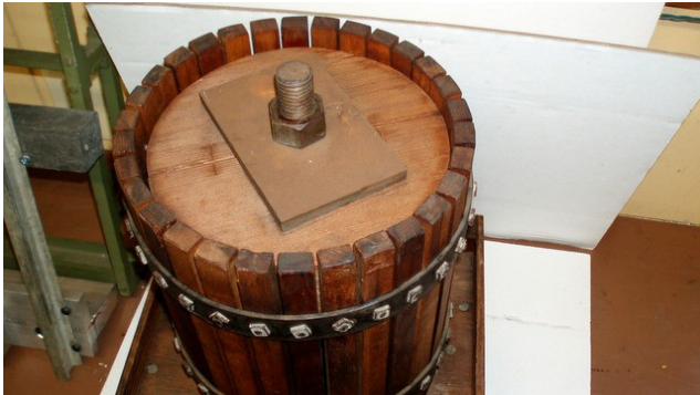
From Walt Oellerich – A wine press,