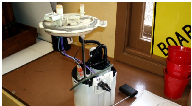
From Bob Morris – Fuel Pump Woes; a tale of “sticker shock” in having to replace a fuel pump for his truck (quoted $1200)!