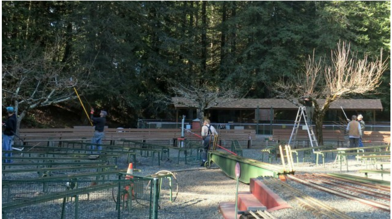
Saturday, February 29, 2020 Tree Pruning Work Day