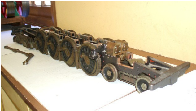
Mark Fleming – 2½” gauge Great Northern locomotive 4-8-4, in progress.