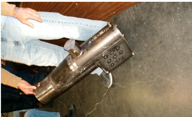
Cecil Yother (New Boiler) - Self-constructed steel boiler for his Ken Schroeder-designed "Shay". Beautiful welding job. One of two boilers built for identical engines, each representing approximately 40 - 50 hours of work. A boiler represents the single most important constructed part of a home-built steam engine, and is normally the determining factor in the total success of a project.