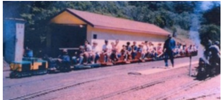
Photo shows the engine has exceptional power, pulling at least 36 passengers. For those looking for a good engine to get into the hobby, here's your chance!

Two available where each one has 2 24-volt electric motors per axle (total of 8 motors) with a flat car riding car included with the purchase.