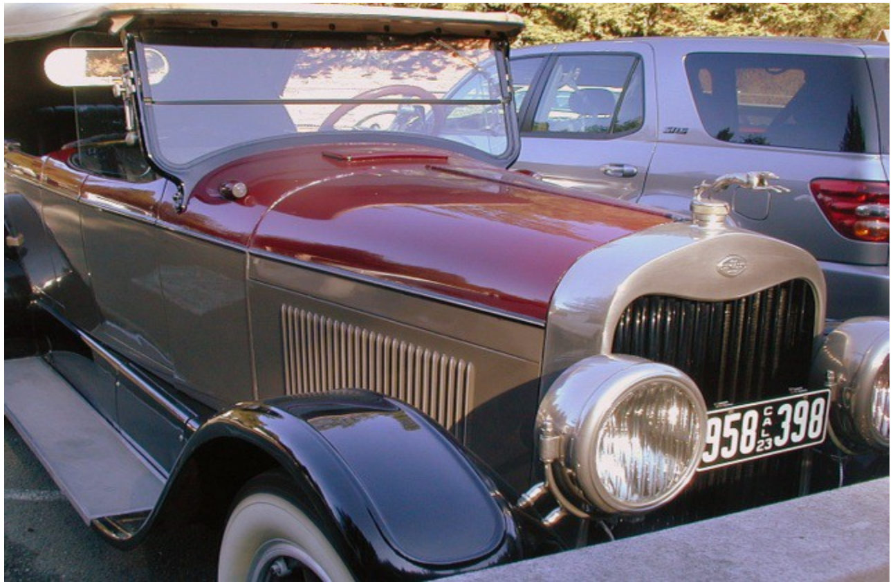
An Elegant Ride to the 2013 Chili Run