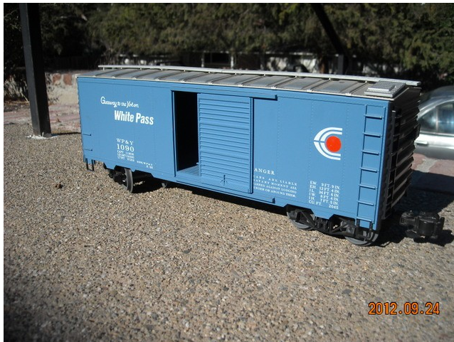
#1 Gauge; Price $50 or OBO

See the CLASSIFIED ADS page in our web site at ggl.s.org for photos and information on other items for sale.