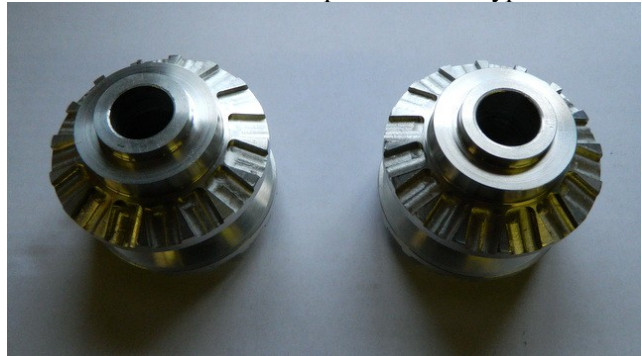
Wheel Hubs for his Model Maclaughlin Steam Tractor.