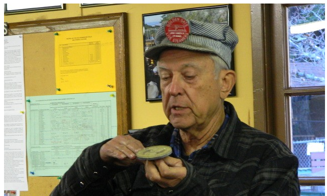
Number Plate for Club Engine. Hay Baler Parts : Hubcaps for Wheels made from cast aluminum, inscribed "CASE".