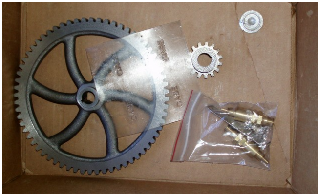
Gears for idlers on the Hay Press.