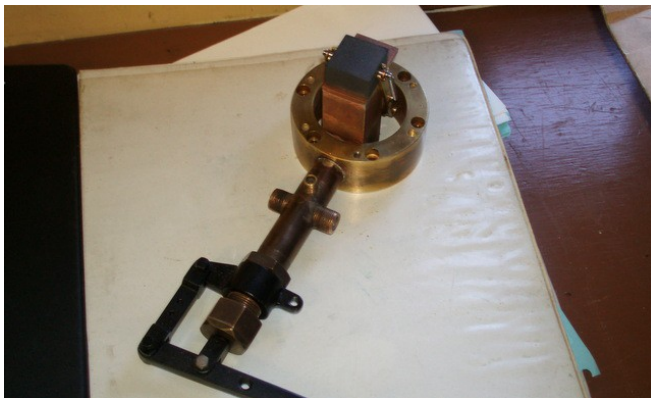
Charlie Reiter - Throttle for scaled-up "Kozo" style HEISLER locomotive. Nice Brass work.