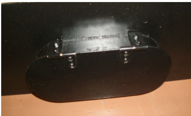
Rich Croll - Tender Top w/Water Filler Lid - Used Brass Hinges for lid.