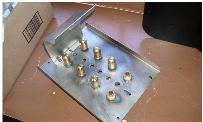
Jerry Kimberlin - Shay Propane Burner with Arch Plate, with a Slide feature on burner base plate to meter the primary air flow. With Star burners. Shay Safety Valves.