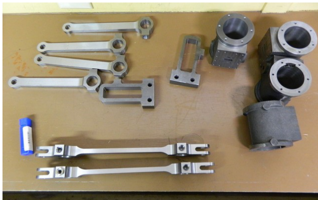
Anthony Duarte - Miscellaneous locomotive parts for a 2-1/2" scale 2-8-0 locomotive. Not produced from known plans, but scaled down from a live prototype found in Colorado.