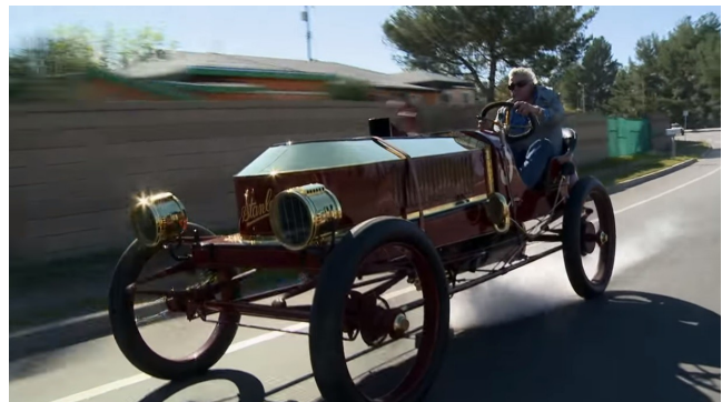
The second is a 28:55 minute video about a 1906 Stanley Steamer Vanderbilt Cup Racer. The last time you saw the 1906 Stanley Steamer Vanderbilt Cup Racer, the steamer blew up. But now the old scorched 23-inch boiler's been replaced with a new 30-incher, which provides much more hp - so it's faster than ever! www.youtube.com/watch?v=5Me8b0ed59s