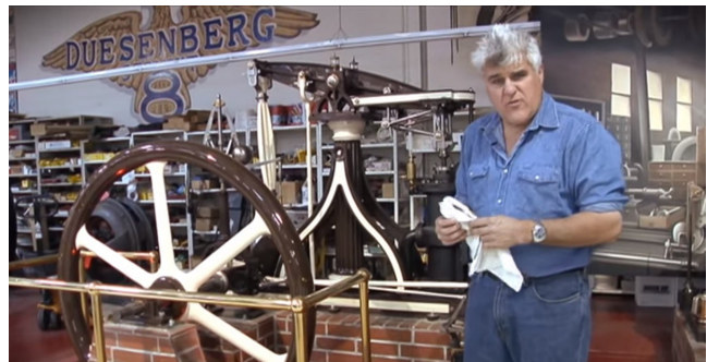
The first one is a 8:07 minute video on a 1832 Steam Engine. Designed and built in England in 1832, this steam engine originally ran a dye factory. www.youtube.com/watch?v=zoBWAE0win0