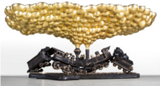
Sent in from Charlie Reiter, a delightful sculpture with a humorous background: