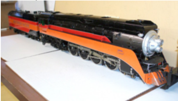
1:32 scale Model "GS-4" steam locomotive.