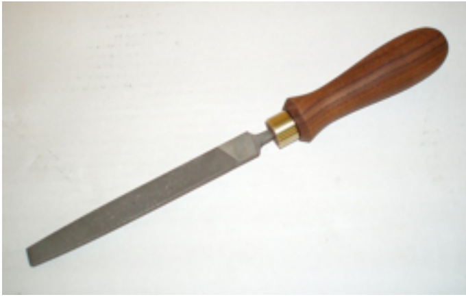
Rich Lundberg – Walnut File Handle