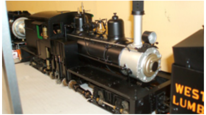
1:20.3 scale Model "Shay" steam locomotive.