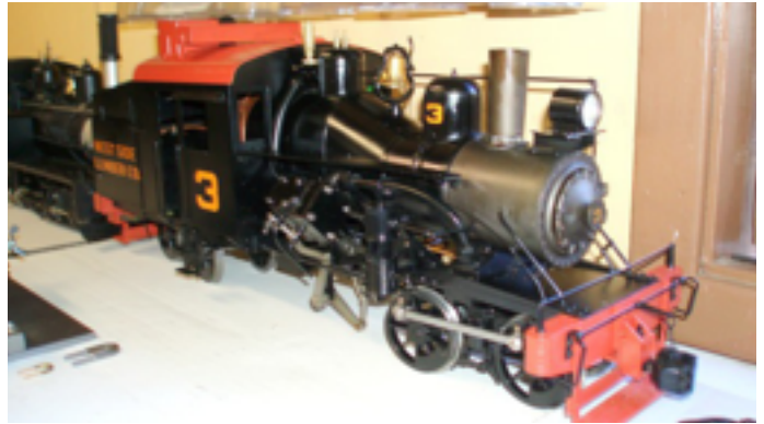
1:20.3 scale Model "Heisler" steam locomotive.