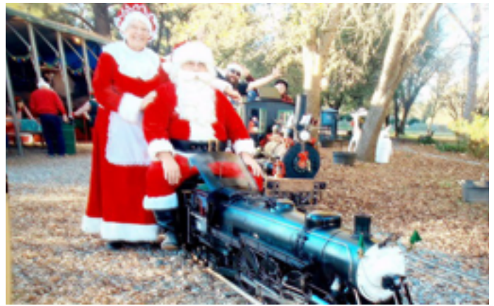
Photo of Santa Claus on a Steam Locomotive model.