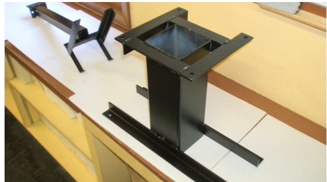
Rich Croll – Steel Support structure for the hand control box of the club's new electric locomotive.