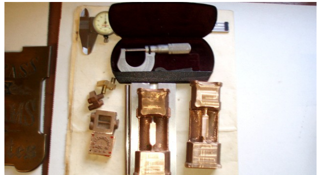
Worthington horizontal steam pumps brass casting in progress. Parts.