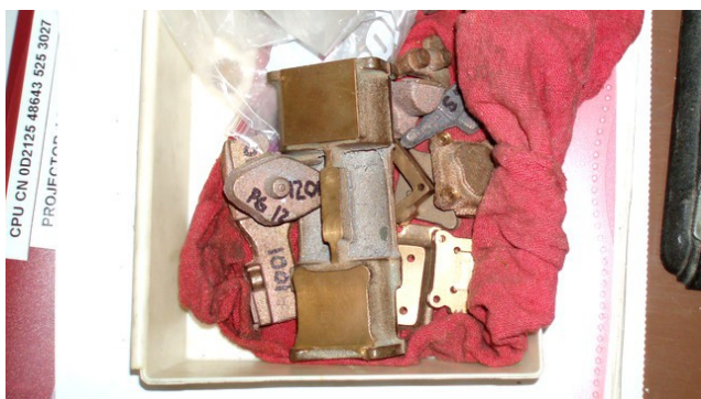
Ken Brunskill – Worthington horizontal steam pump brass casting from Coles (no longer in business).