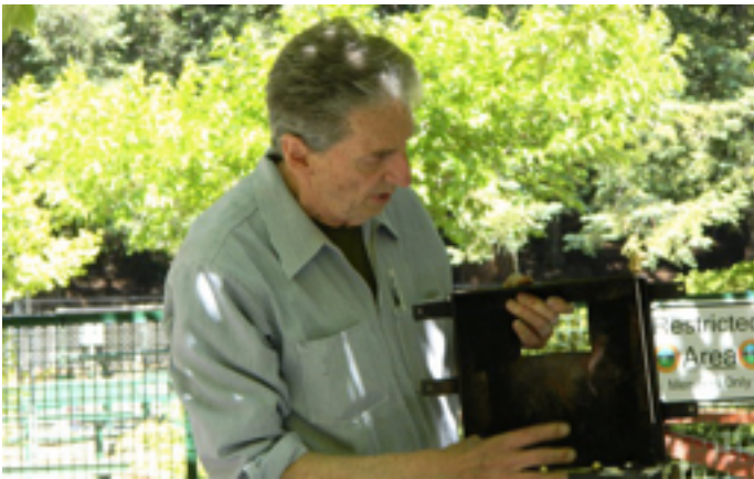
The fire pan from the club Pacific loco, with an undisclosed malady.