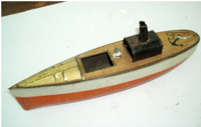
An old time "Putt, Putt " boat model (made in Japan),

Little Engines Loco. The bend is to wrap around a drive axle?!