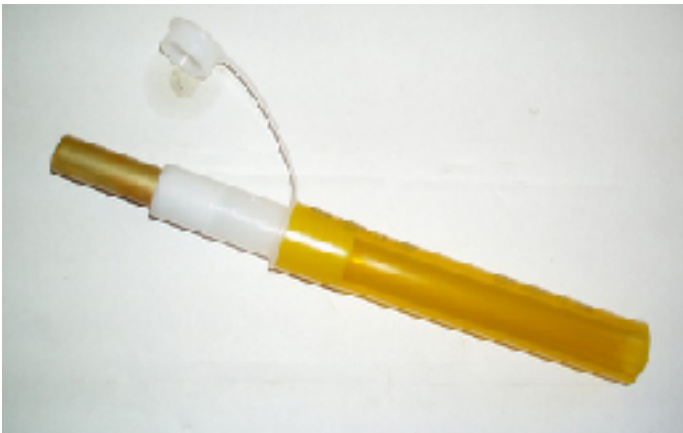
Rich Croll – Gas Extension Filler Tube.