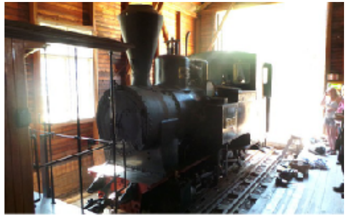
A narrow gauge 0-6-0 engine (also known as the Tertitten) was built in 1895 and is run during the summer time.