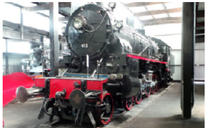
Also in the Norwegian Railroad Museum is the NSB 31b class 2-8-2 no. 452 1926.