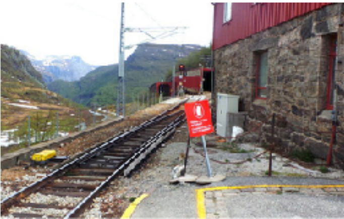
Also Myrdal Station which shows the steep 8 degree slope approach.