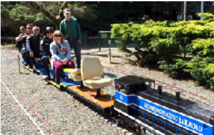
Photo 1: East Bay Regional Park Police get ready for a tour of our facility.