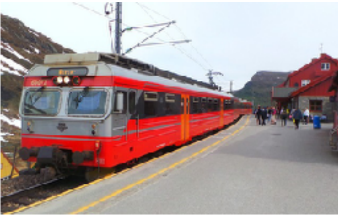
Myrdal Station where the Flam Railway meets the main line.