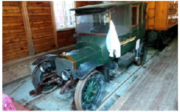
At the Norwegian Railroad Museum at Hamar, Norway, Rich took several photos there including that of a railroad inspection car.