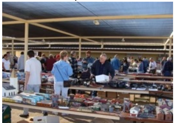
On Sunday, June 5th, we are having a Swap Meet/Pot luck/Run Day at GGLS after our usual monthly club meeting.