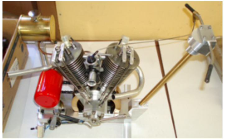
Paul Denham – Bay Area Engine Modelers (BAEM) – “Hoglet” ...A running model of a Harley Engine!