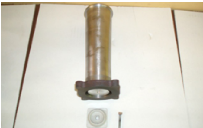
Rich Croll – Stack for 2-1/2" scale Shay hogged out from a solid chunk and a poling pocket he created.