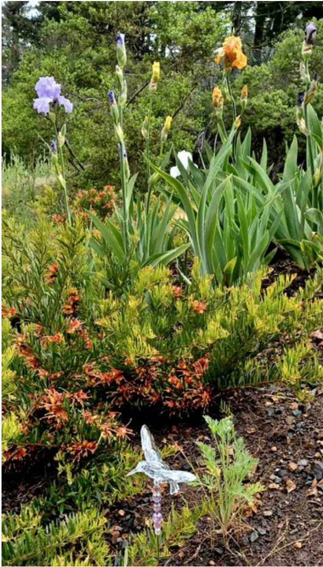
Flowers & birds are joining the bears to enjoy spring!