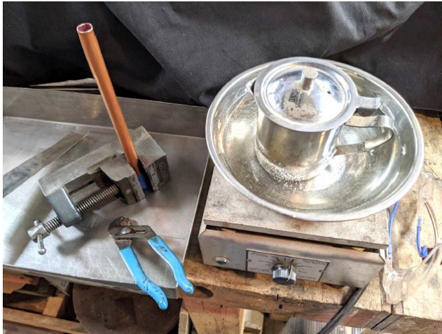
This is the setup used for the pour.

In my project I needed to make a couple of 60 degree elbows in 1/2" tube. I don't have a 1/2" bender and looking at a 3/8" bender I realized that in a commercial bender the radius would be too large. So I machined a pair of rollers to fit a bender I had. I started with a stainless tube but the radius could not be bent without flattening the tube so I substituted copper on the second try.