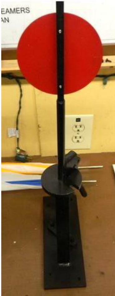
If anyone is interested Bob has enough parts to build several of these beautiful little line side features.