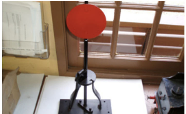
Bob Morris - A Switch Stand made by late GGLS Associate member Jim Hoback.

During fuel transfer, the pressure bleed valve must be closed when any operating engine is within 30 feet of the fuel transfer point. Propane fuel transfer is absolutely prohibited at the steaming bays. -