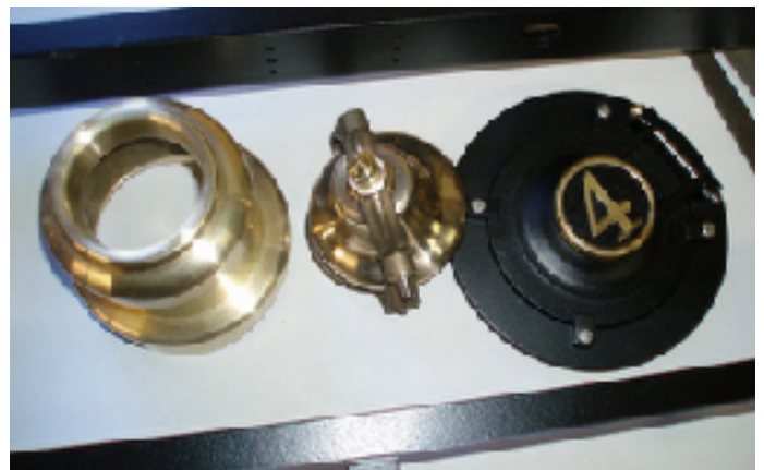
and bell is turned from a casting.