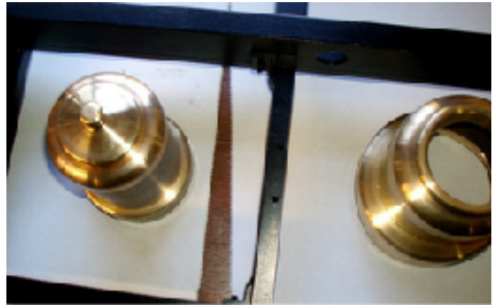
sand & steam domes