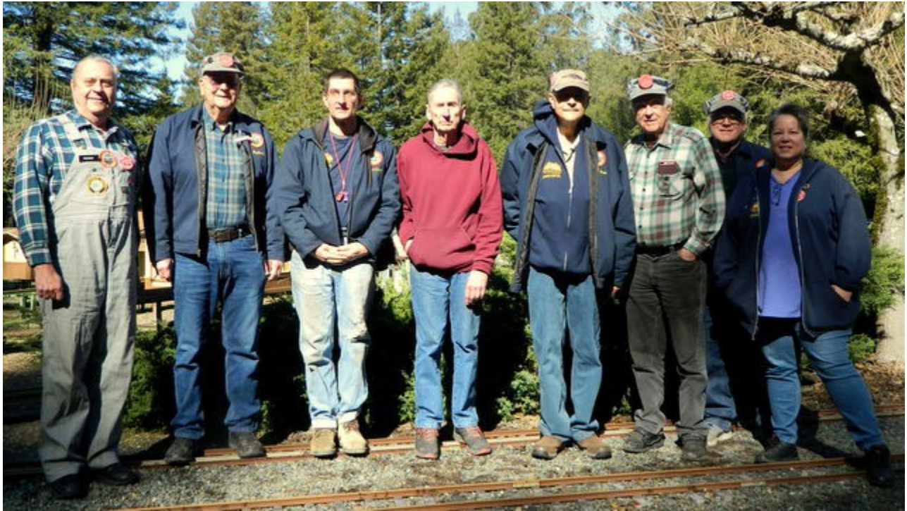
The 2023 GGLS Board Members