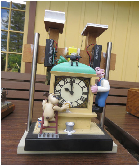
Wallace & Grommet, of the Bay Area Engine Modeler's says:

"Time to see you at the 2020 Spring Meet"