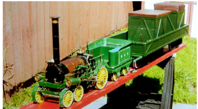
This locomotive has been converted to run on propane and runs smoothly. As shown, this comes with a riding/auxiliary water car.