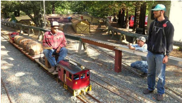
The logging train is pulling into Mel's hand powered saw mill station while some GGLS members took photos.