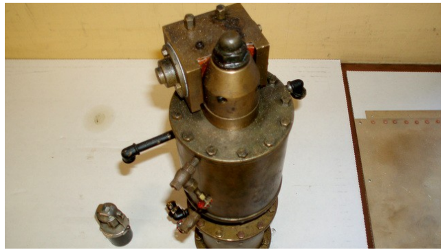
Bob Cohen – Old Steam Pump from the RGS #22.