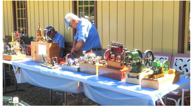
Our cousin club, the Bay Area Engine Modelers (BAEM), was in force and showing their member's internal combustion engine. Something not to be missed if you have never seen them before.