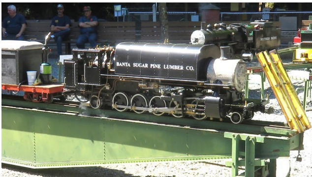
Others are looking for it's owner to take them out or to just enjoy the sun & admiration of train lovers everywhere.