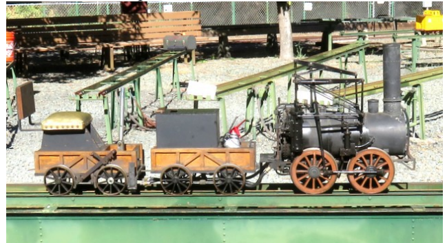
Walter Oellerich's Stourbridge Lion is showing off it's glands and