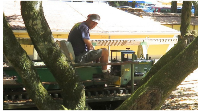
A few were seen on the track, huffing & chuffing or buzzing along giving the happy riders a smile (maybe).