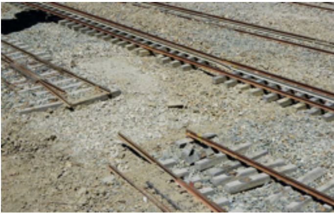
The Thursday crew has been busy re-bolting the service and yard tracks.