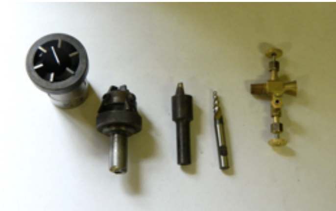
Jerry Kimberlin - 5 items: 1) acquisition of a 15 pc. set of "Hollow" mills, for use on a power turner such as a lathe or mill, a 7/8 inch diameter example shown in

the photo. Hollow mills are used for repetitive outside turning of quantity parts. Perhaps they may be valuable for rough sizing of custom bolt studs; 2) an Adjustable Hollow Mill w/carbide teeth, for use on a turret; 3) Tapered End Mill to make tapered holes. 4) a small hand-built Carburetor for use on an IC engine; and 5) "D" bit, a quick means of producing custom sized drill bits not requiring quantity production. However, I know that custom production "Scottish and Irish" Bagpipe construction utilizes custom "tapered D bits" which are generally hard to find and very expensive.