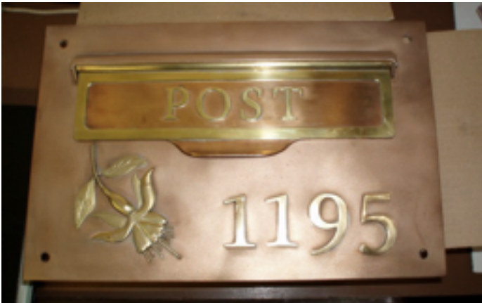
5) a completely "hand fabricated" Mailbox gate, made of brass and bronze.