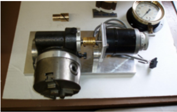
Charlie Reiter - 5 items: 1) A Refurbished Boiler Gauge from the old GGLS Stationary boiler; 2) Eccentric, used to "forward/reverse" his Road Roller, under construction, 3) CNC "A" axis, to be used, I believe, on either the bed of a Mill or a surface plate; 4) Custom made hand-planer "knife" made to produce custom moldings, sometimes not available because of their antique origins; and