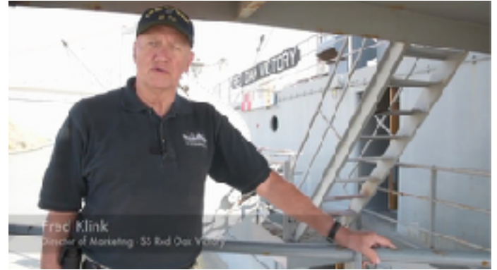
A 2:00 minute YouTube video selected by Bruce Anderson talking about the SS Red Oak Victory engine boiler light off.

https://www.youtube.com/embed/HGHjC6hMjm4