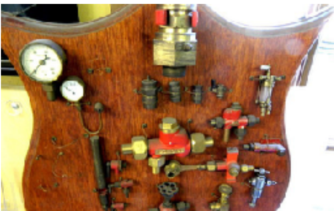
Bob Cohen – Bassett/Lowke display board, showing samples of small steam parts for steam engines