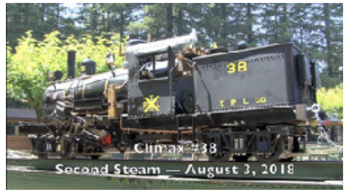
Second Steam of the Climax

https://www.youtube.com/embed/F61vEE-xcaw