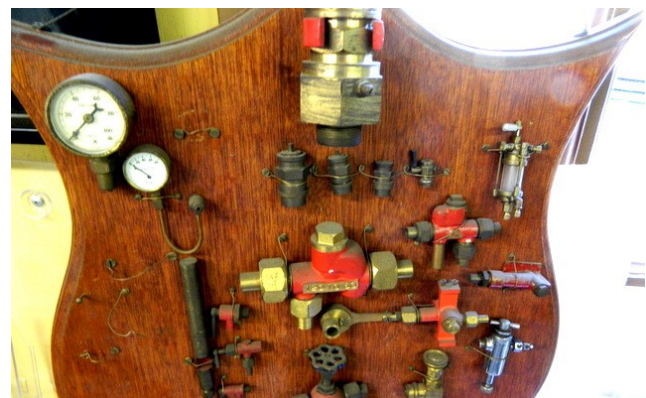
Bob Cohen – Bassett/Lowke display board, showing samples of small steam parts for steam engines.