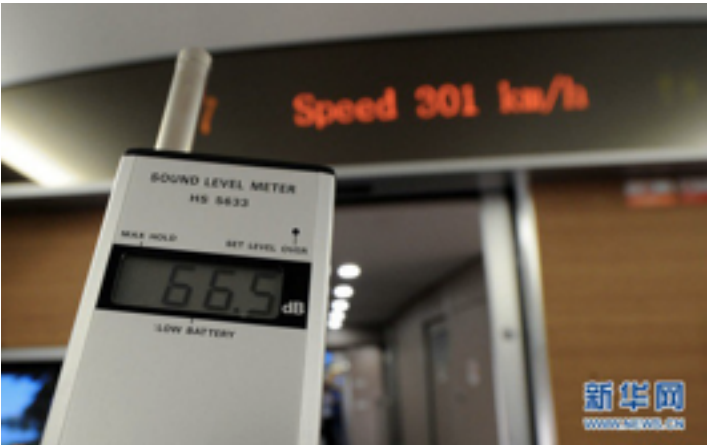
So quite! So smooth!