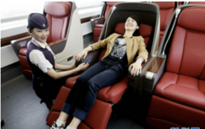
The trains have 1st class, business and VIP cars, as well as economy class, of course.