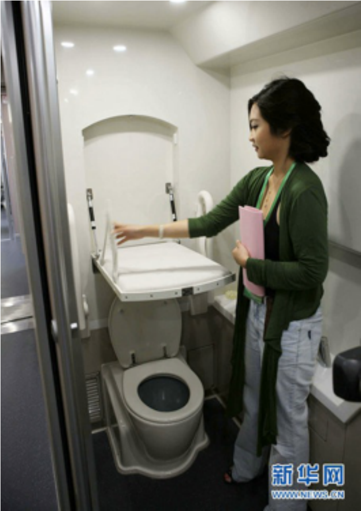
There are also dedicated disabled areas, wheelchair accessible bathrooms and corridors.