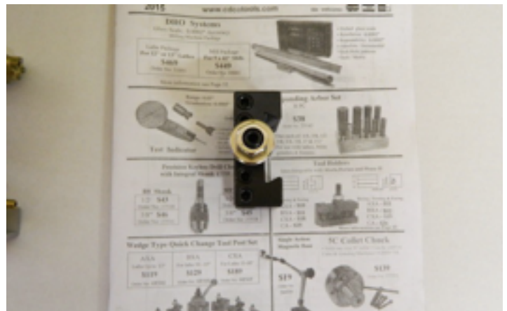
Also a Chinese-made (cheap) tool holder, BXA size for use on an lathe quick-change type tool holder, similar to the Aloris system.