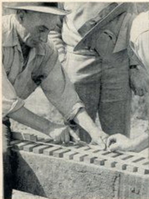
Aluminum rails are spiked down on eight-inch wood ties. Continuous 30-inch-high, 1,331-foot-long trestle is made of old railroad bridge ties, donated by Southern Pacific, resting on 147 piers.

Inside Shattock's basement workshop are more examples of the railroaders' craftsmanship. An authentic reproduction of a trackside water tank fills a waiting New York Central "870." An electrically operated turntable reverses locomotives, while a roundhouse shelters a pair of 4-6-2 Pacifics flanked by a pair of 2-8-2 Mikados. Short lengths of test tracks, set up around the walls of the cellar, hold an assortment of engines and