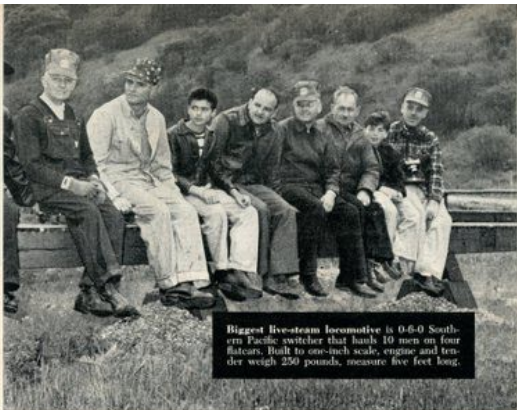
Biggest live-steam locomotive is 0-6-0 Southern Pacific switcher that hauls 10 men on four flatcars. Built to one-inch scale, engine and tender weigh 250 pounds, measure five feet long.