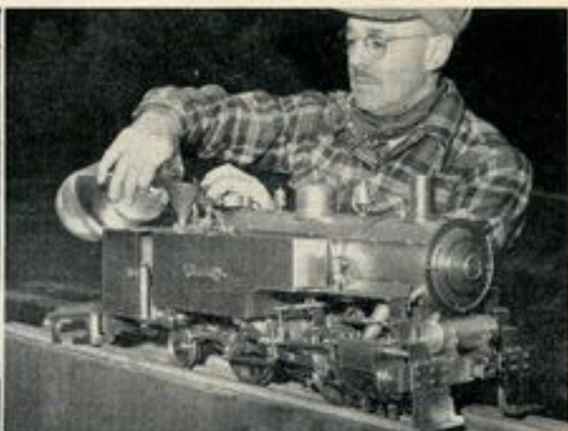
Most models are reproductions, but this dockside switcher is an original design. It weighs 100 pounds, burns wood alcohol instead of coal.

boasts 49 members and 1,331 feet of continuous track. The trestle's 30-inch height permits engineers and passengers to ride side-saddle behind their chugging engines on cushion-padded flatcars. Four rails laid side by side take locomotives of three gauges—2½ inches, 3½ inches and 4½ inches.