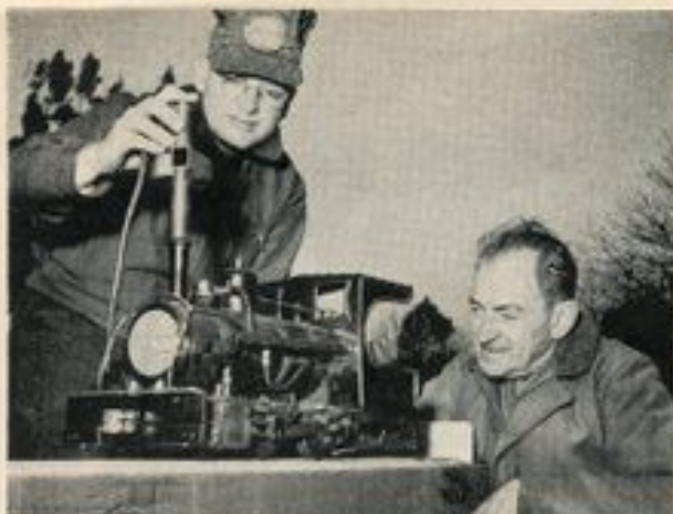
Firing up. Loco gets help from small electric pump that draws air through stack to fan flames. Once fire is going, steam jet creates draft.