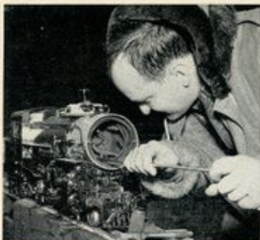
Tiny boiler tubes must be periodically scraped clean with gun rod to keep them from fouling. Use of distilled water cuts down scale deposit.