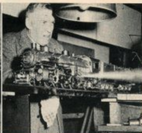
Ready to hit the high iron, this mighty 2-8-2 Mikado blows steam as she gets up pressure. Throttle and steam-pressure gauge are in cab.

running gear in various stages of assembly.