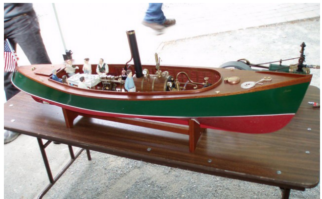
Here is a lovely example of a remotely-controlled steam launch, built, owned and operated by GGLS member Jim Pate. I wonder if some members could put up a large wading pool and run some of the boat models under steam!