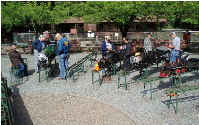
Many of the steam locomotive engineers came early get a steaming bay to begin the steam-up ritual.