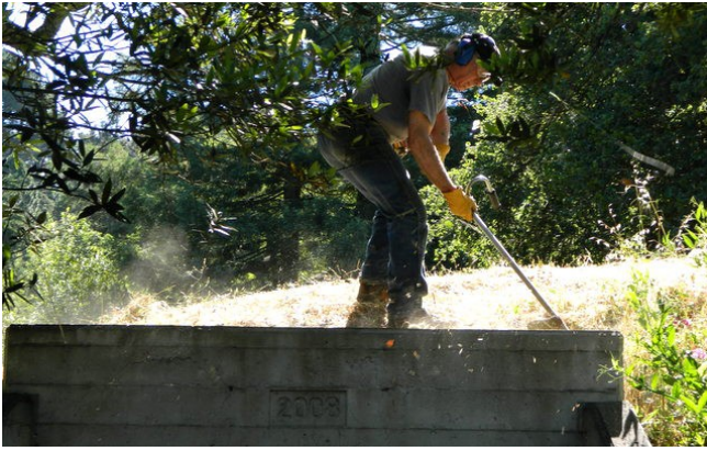
One of the weed eating virtuoso is Don Ratto who is working on top of the tunnel ...