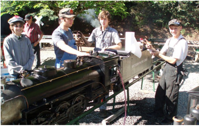
The GGLS club engine is being steamed up by some of the junior members of the club. This engine is used to haul the Public Train every Sunday, weather & staff permitting.