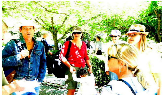
They came down (as shown by this over-exposed photo) and contributed much musical entertainment during the afternoon.