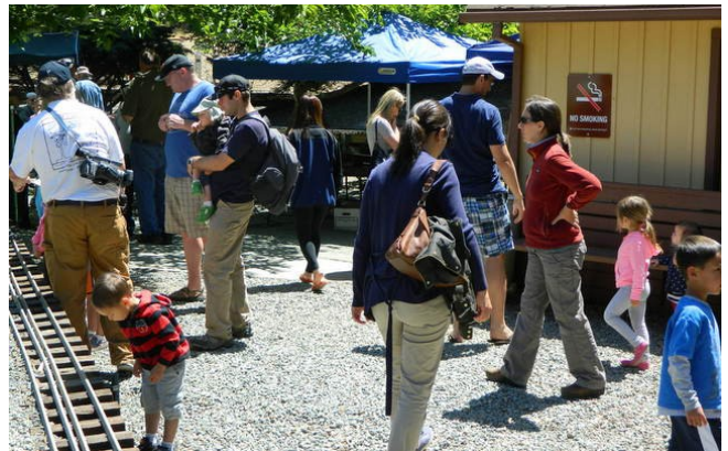
the Public had a chance to mingle around and ask questions.

As we move closer to the steaming bay area, on the display track was