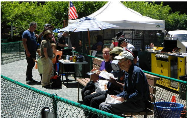
The Open House for the Public is staged from 11:00 am to

I attended the Sunday portion of the Spring Meet because of prior commitments to meet individuals and visitors during our Open House.