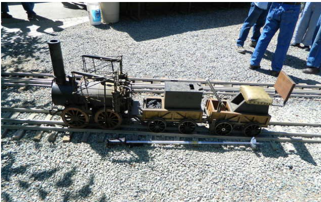
a wonderful little Stourbridge Lion owned by some lucky individual and

As we move closer to the steaming bay area, on the display track was