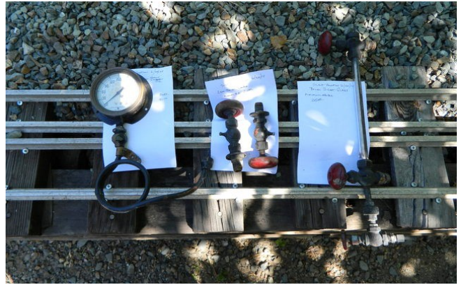
some steam accessory components from a dismantled steam boiler being silently auctioned off at the end of the meet, while