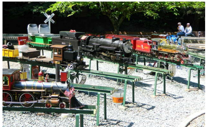
Around the steaming bay, the number of steam locomotives for viewing by the Public felt somewhat smaller than in previous meets but there still was considerable activities going on.