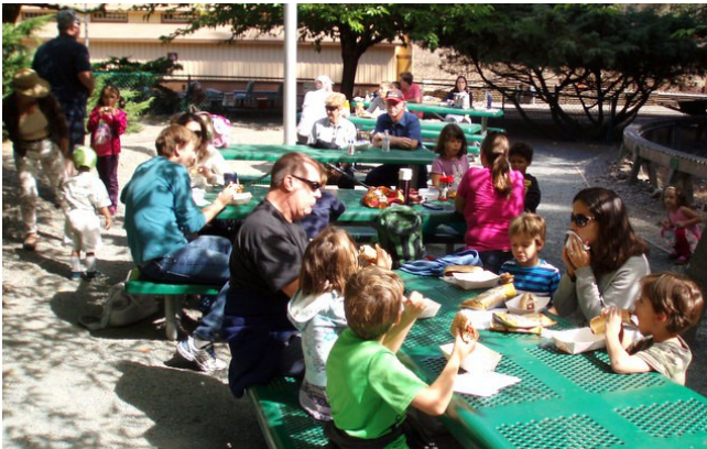
Picnic table enjoying the sun.