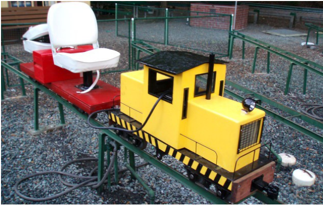
A nice yellow Plymouth switcher.