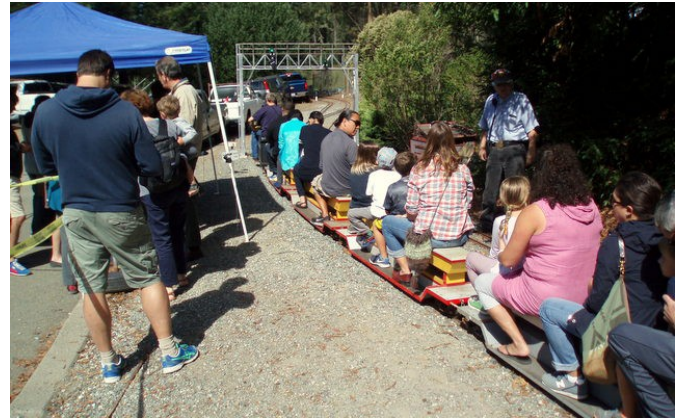
The Public enjoying a ride on the Mainline outer loop.