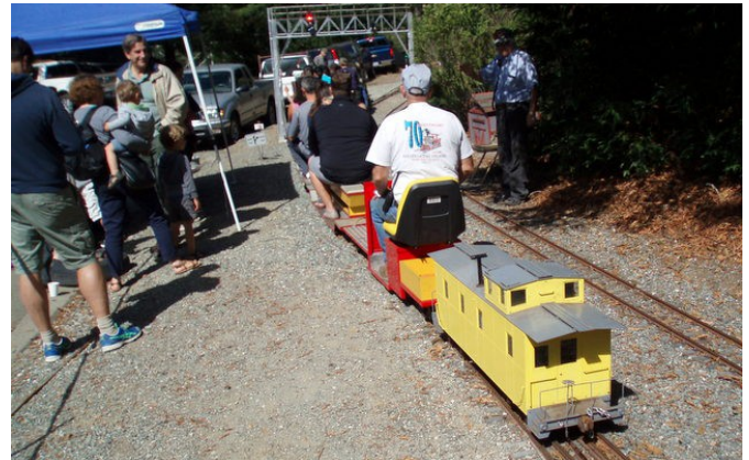
The Public Train caboose.