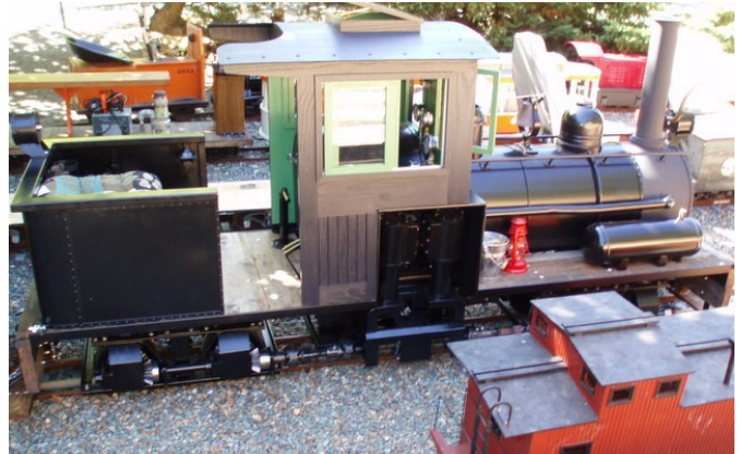
Matt Thomas's big gas shay.