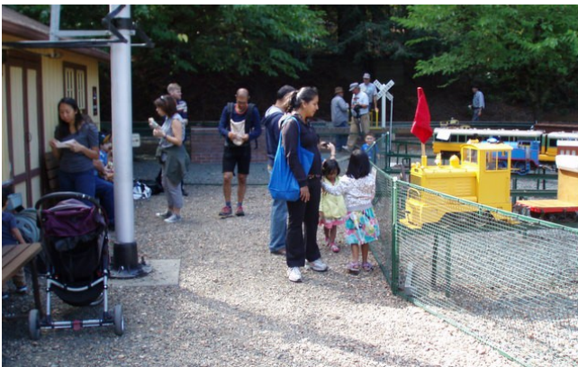
The public enjoying the steaming bay.