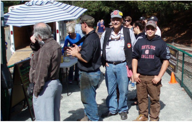
Hungry club members!