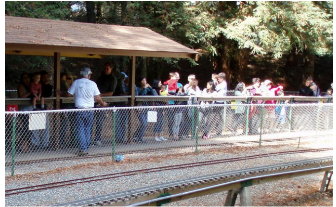
Wide look at Tilden Station.