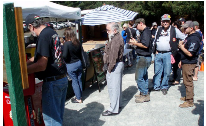
Hungry line at Jeff's Pit Stop.