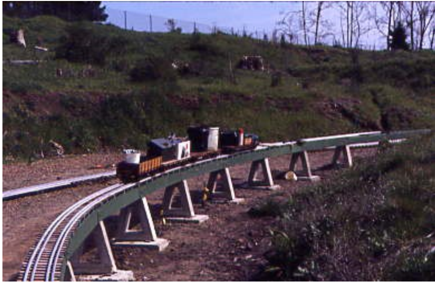
Hi-Track construction train. February 1974