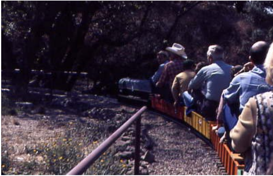
Aboard the club's Public Train on the Bay Tree Trestle before there was a Heintz Loop. Fall Meet 1974