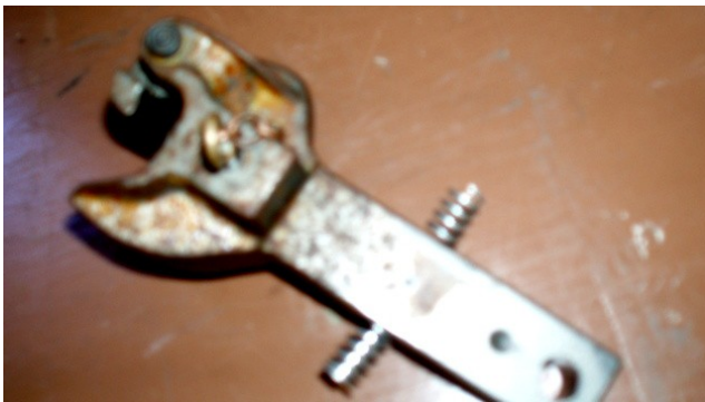
Rich Croll – Spring loaded front coupler.