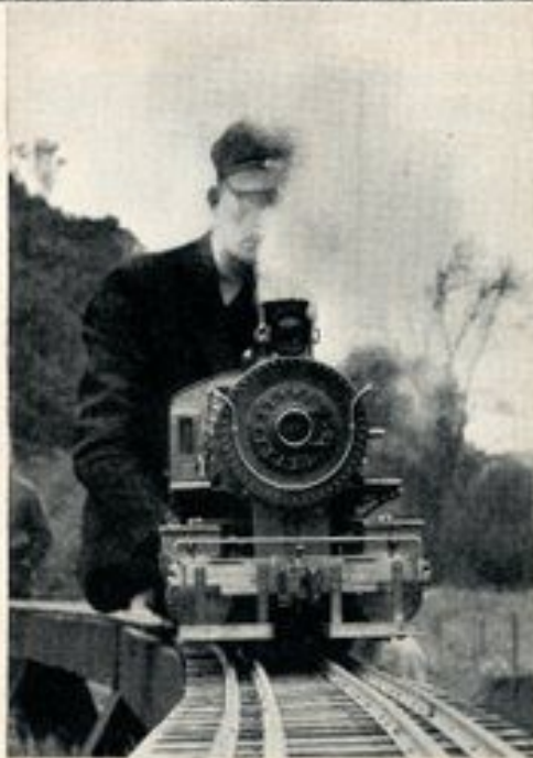
Special four-rail track takes three gauges of locomotives—2½-inch gauge for ¾-inch-to-the-foot scale; 3½-inch gauge for ¾-inch scale; and 4½-inch gauge for the big one-inchers.